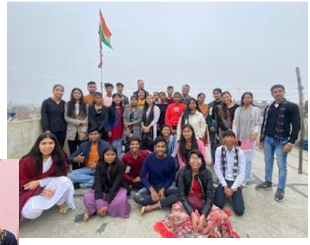
Republic day, and others performed a dance. It was an opportunity to come together and share the lessons of the festival.

And in March we had the pleasure of celebrating Holi together.